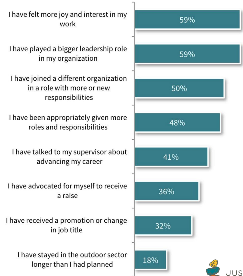
Exhibit 4 | n=44