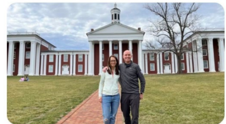
UTAH'S FIRST LADY ABBY COX IS JOINED BY GOV. SPENCER COX TO TALK ABOUT SOME LIFE UPDATES, THEIR RECENT TRIP TO ATLANTIC CITY, NJ FOR THE NATIONAL GOVERNOR'S ASSOCIATION AND THE IMPORTANCE OF BUILDING BIPARTISAN RELATIONSHIPS WITH OTHER GOVERNORS THROUGHOUT THE COUNTRY.

RECENTLY ON FIRST LADY AND FRIENDS PODCAST